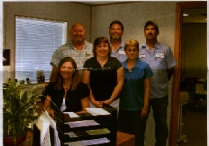
Adair Co. PWSD #1 Employees

Missouri's new Eminent Domain Law has a major impact on how Water Systems handle easements. A new Easement form has been created to comply with new regulations.